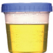
YELLOW AND CLEAR, LIKE URINE YOU'RE READY!

Expected Stool Color Changes During Bowel Preparation