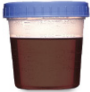
BROWN AND MURKY NOT OK