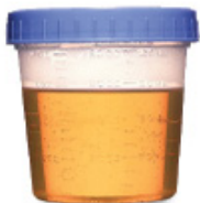
LIGHT ORANGE AND MOSTLY CLEAR ALMOST THERE!