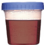
DARK ORANGE AND SEMI-CLEAR NOT OK