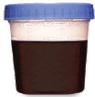
DARK AND MURKY NOT OK